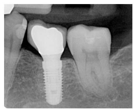
Fig. 3 : Stable clinical situation of a SCREW-LINE implant 5-year post-loading in regio 36

The Promote surface has proven to be effective in various preclinical and clinical studies over years (12). A study investigating different implant systems including more than 6'000 Camlog implants in private practices over more than 10 years showed the highest probability of survival for implants with Promote surface (13). Very positive mid- and long-term treatment successes with CAMLOG implants have been documented in clinical trials for various implant lengths and diameters_(13, 14, 15, 16), for various indications and various surgical and loading approaches (17, 18). A recent international multicenter study in daily dental practice reported a high survival rate, excellent stability of hard and soft tissues as well as patient reported outcome measures (PROMs) showing over 99% of satisfaction at 5-year follow-up controls (19) (Fig. 3).