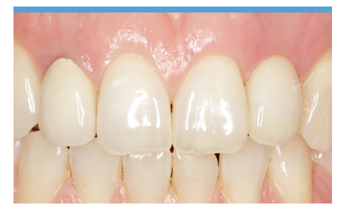
17. The lithium disilicate crown was permanently inserted with self-adhesive composite luting cement (N. Mirschel, Impladent laboratory). The crown was painted carefully with a layer of cement. The precise positioning of the "preparation margin" meant the minimal excess cement could be removed simply and without leaving any traces.