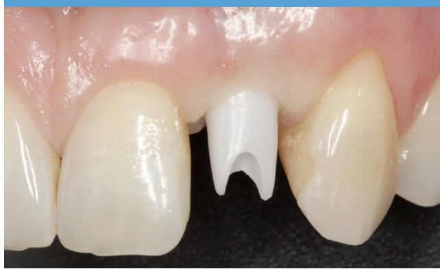
16. The crown-abutment interface ultimately came to rest around one millimetre subgingivally all the way around. The anatomically shaped emergence profile of the abutment establishes the foundations for a permanently stable, aesthetic restoration. It supports the gingiva all the way around with moderate pressure. Good blood flow is restored to the area around five minutes after the insertion.