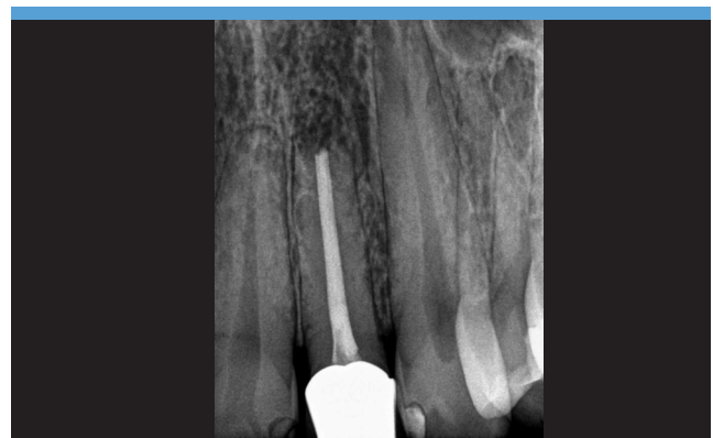
2. The dental x-ray shows the situation following the apical resection. At the time of the tooth fracture, there was no appreciable apical or periodontal infection identified and so, following a corresponding clinical assessment, the patient could be promised an immediate implantation following extraction.