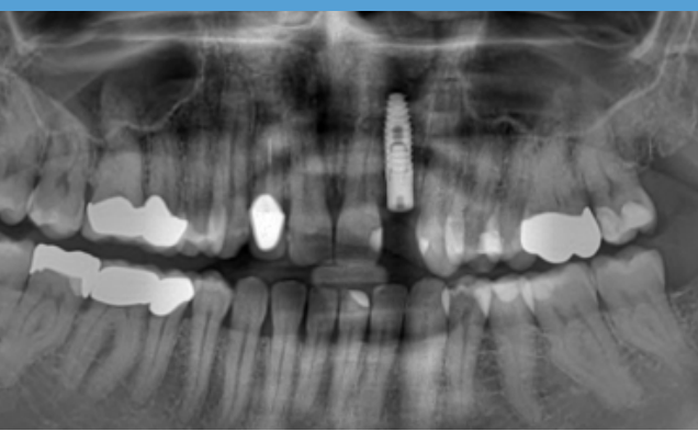
12. A panoramic radiograph was performed for control purposes following the surgery. The patient was supplied with an excellently supported interim denture for the healing-in period.