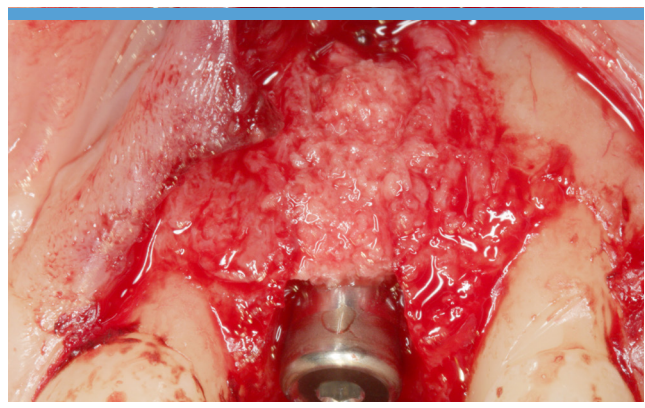
8. The implant is initially covered with autologous bone to reconstruct the alveolar bone and the incongruity defect. The configuration of the PROGRESSIVE-LINE burs is well suited to the collection of the autologous bone chips. Additional bone can be harvested from the operating site using a scraper.