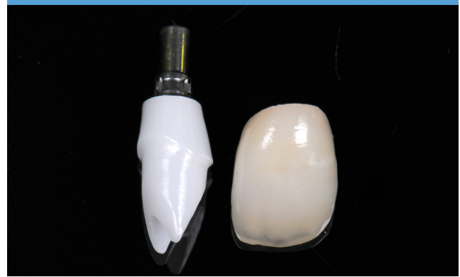
14. An impression was taken of the implant for the production of the final restoration with a single tray and implant post for the open impression-taking technique. An individual CAD/CAM zirconium abutment on an adhesive basis was produced in the laboratory. The focus was on the design of the subgingival sections, which support natural red-white aesthetics among other criteria.