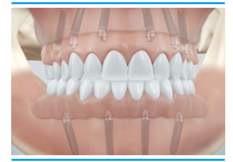
Depending on the initial clinical situation, so-called conditionally removable restorations are also possible in the edentulous jaw.