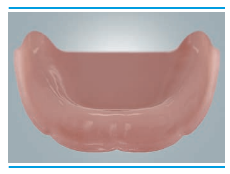
For edentulous jaws, various solutions are available to stabilize or anchor dentures.