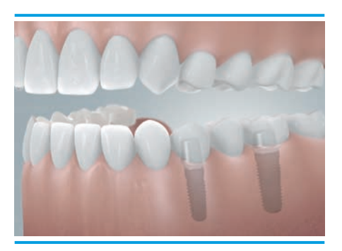
Bridge on two implants to close the saddle area with three missing teeth.