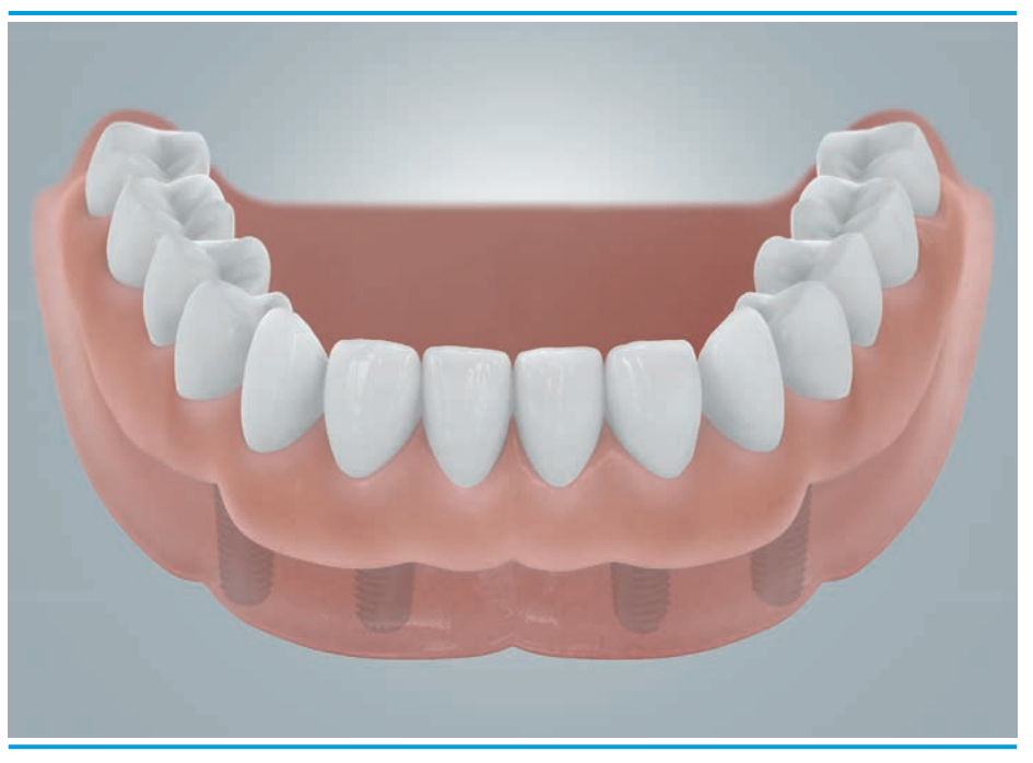
Denture restoration in the lower jaw. All the types of restoration shown greatly improve the wearing comfort of a full denture.