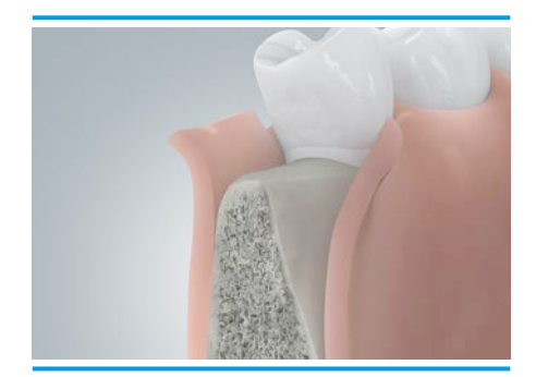
The missing bone volume must be increased to provide all-round anchorage for the implant in the bone.