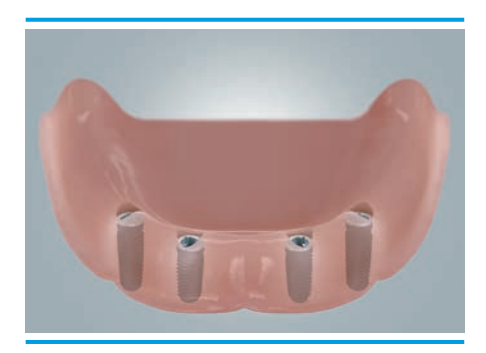
Four implants are often sufficient to stabilize the denture in position.