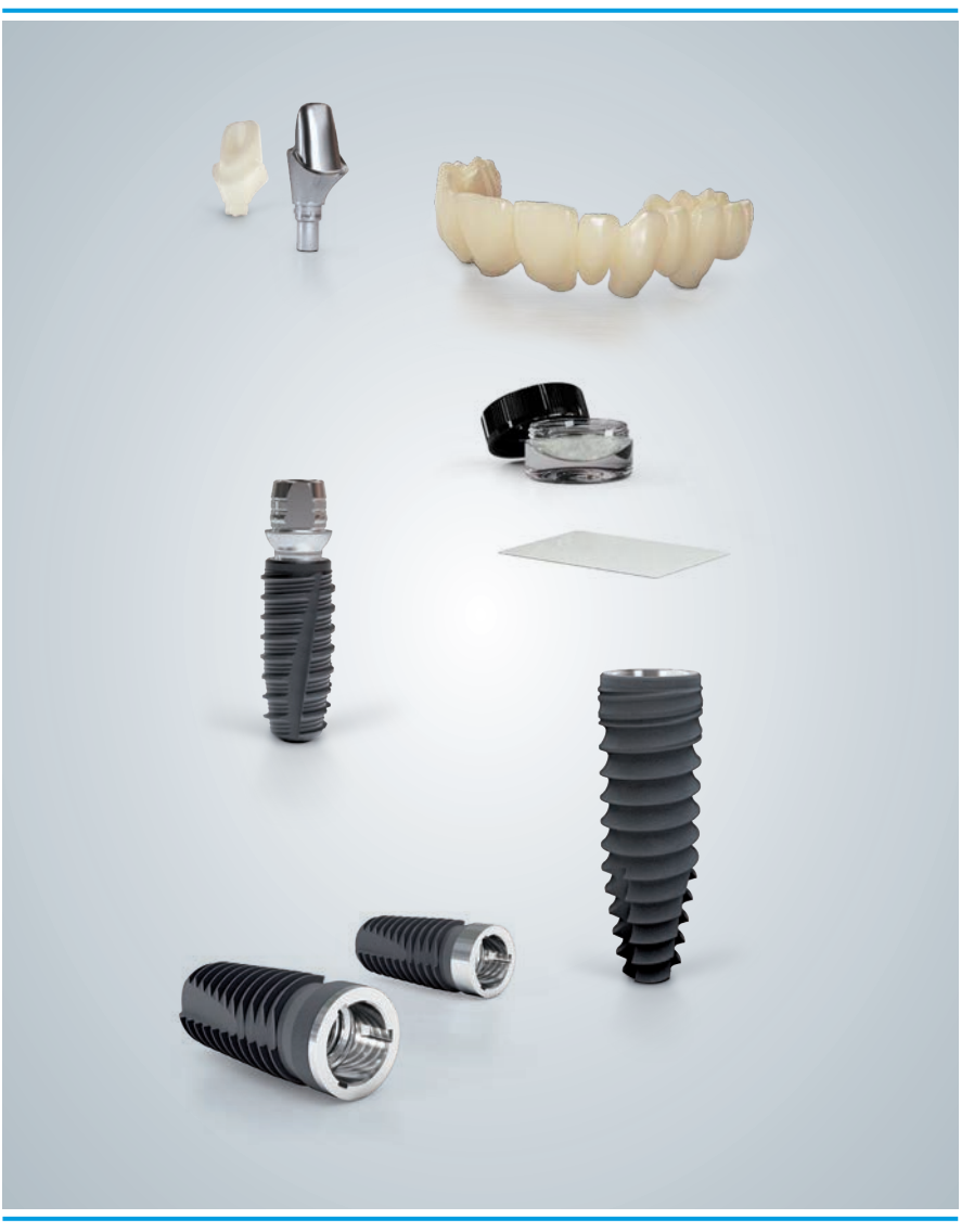
Camlog dental implants are available in different types, shapes and dimensions. In addition, various substitute materials and dental prosthetic components are available to your dentist.