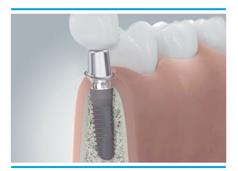
The intermediate piece (abutment) is inserted into the implant so that the crown can be mounted.