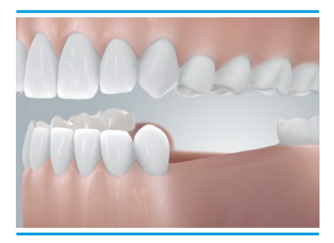
This "saddle area" (three missing teeth) can be closed with two or three implants.