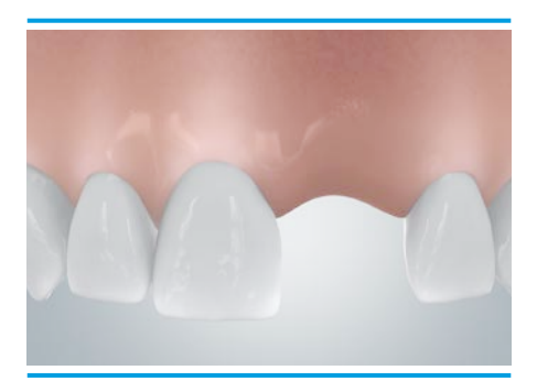
Gaps in the tooth row can be closed in different ways - with a cemented bridge, a removable partial denture or with the aid of a crown restoration on an implant.