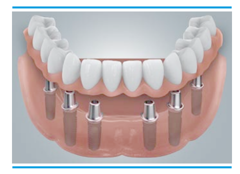
Telescopic crowns on six implants can reduce the denture base as demonstrated in this example.