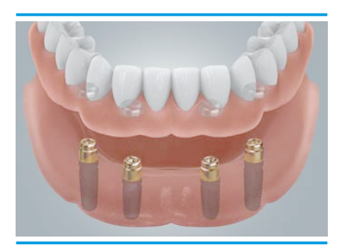
Secure anchorage with Locator® press buttons.