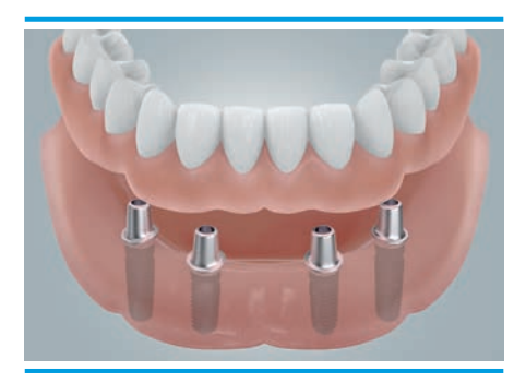
In this example with four telescopic