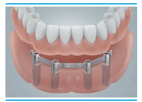
Fixation with a bar.