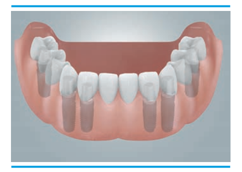
Six or more implants are placed for a fixed bridge restoration in the edentulous mandible.