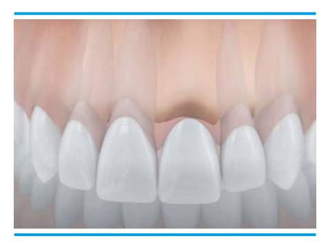
In the case of a bridge, the adjacent teeth on both sides need to be ground to close the gap. The replaced tooth is not connected to the bone. Without bone training, the gingiva and bone can degenerate over time.